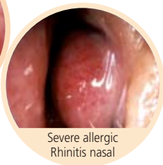
Severe allergic Rhinitis nasal

Symptoms can also include wheezing, eye tearing, sore throat, and impaired smell. A chronic cough may be secondary to postnasal drip, but should not be mistaken for asthma. Sinus headaches and ear plugging are also common.